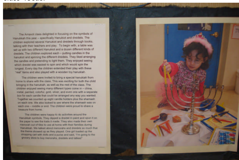
13.2 Holiday Display Board of Hanukkah with each class' focus