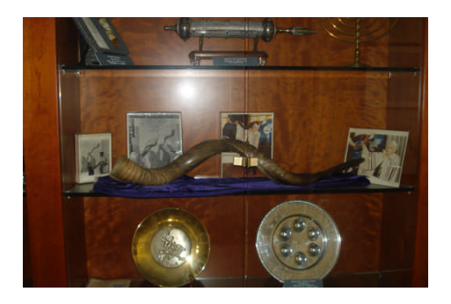
13.2 The Synagogue: Ritual objects in main hallway of Synagogue

• Ritual objects in lobby, outside chapel, gift shop, Sanctuary