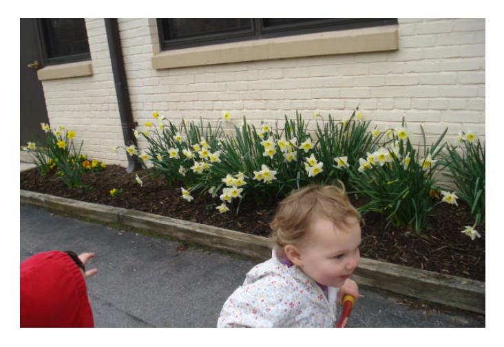
13.8 PTA organized "Planting Day" and each class planted a garden.

The aesthetically pleasing environments that the teachers have created in the classrooms have also demonstrated their sense of responsibility and ownership of the school.