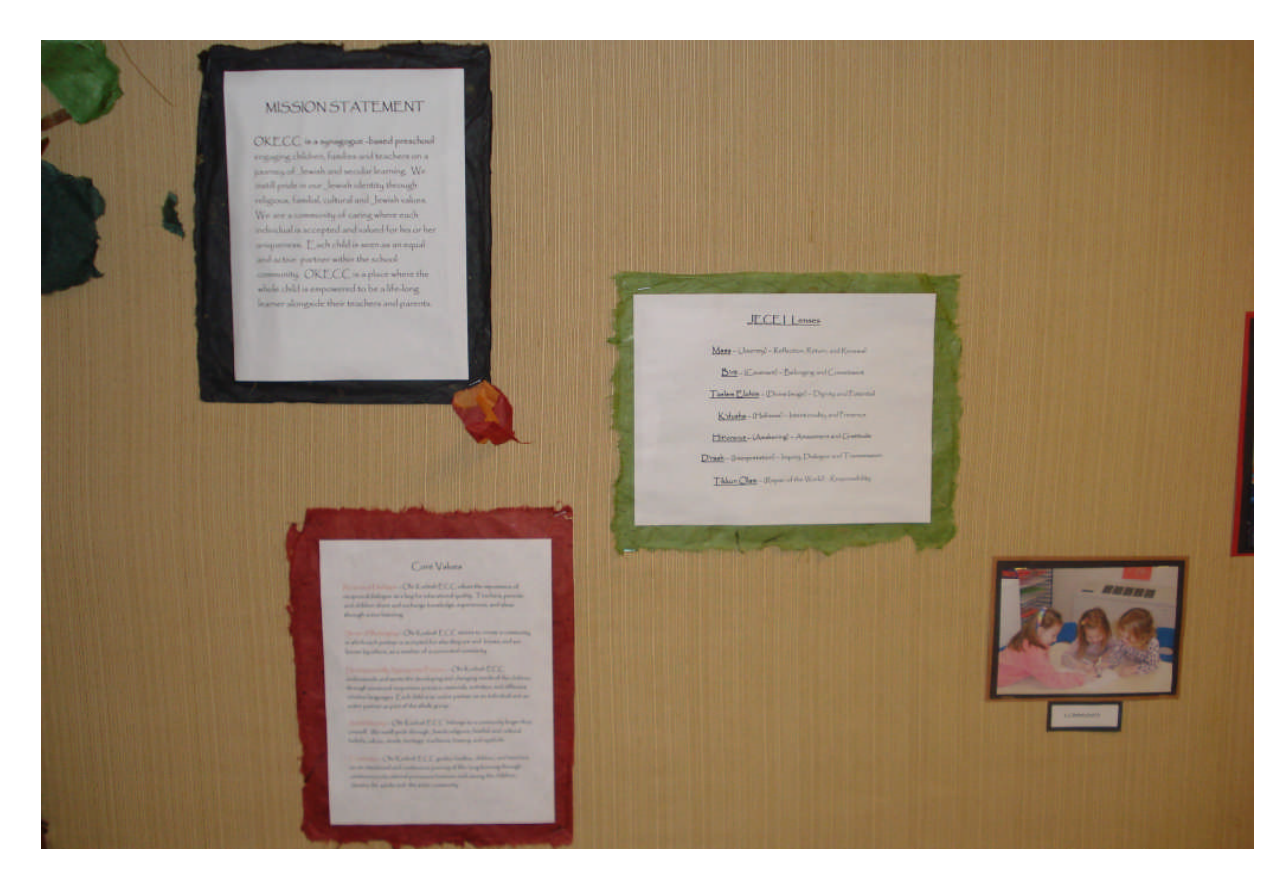
13.1 Hallway display of OKECC's vision, mission, core values and JECEI lenses