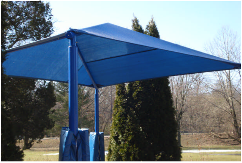
13.8 Canopy purchased by the PTA for the sandbox.