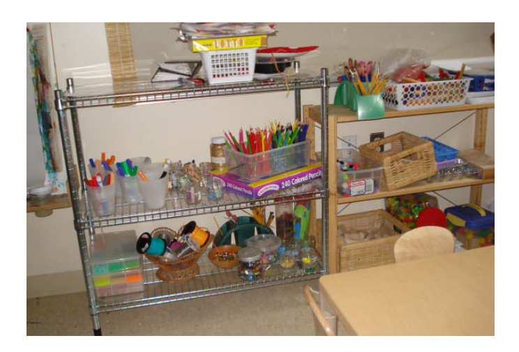
13.9 View of two classrooms presentation of materials