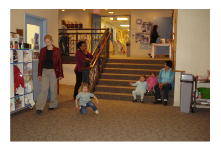
13.5 Main foyer of ECC where parents, caregivers and children congregate before and after school

Evidence: photos of environment, cubbies, arrival and departure, main foyer; sign-in or photo attendance