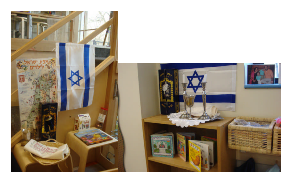
13.2 CLASSROOM: Engagement with Jewish life in the classrooms through Judaic corners and centers